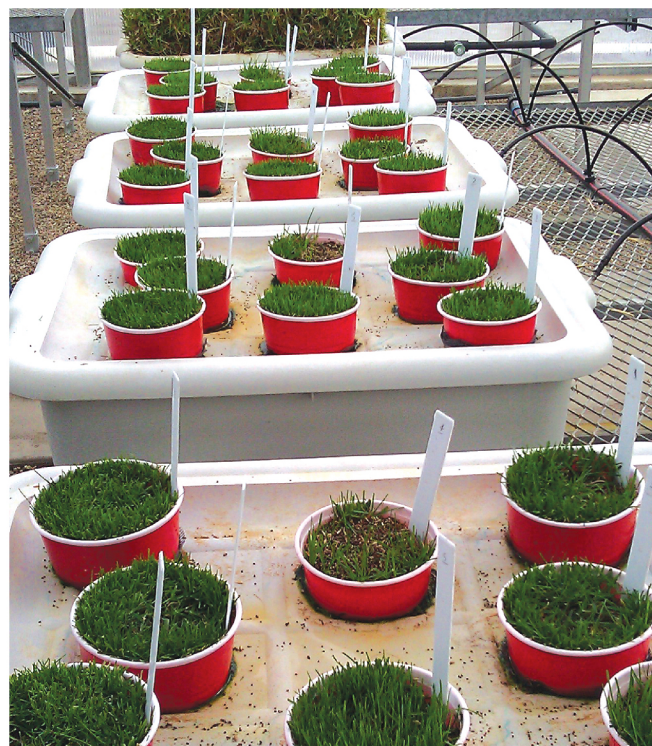
Table: Ryegrass root fresh and dry weights influenced by different application rates of ENCAPSALT™ under salinity stress.

A randomized complete block design with 4 replications was used in this study. Shoot and root lengths and shoots' (clippings) fresh and dry matter weights were determined weekly. After the fresh weight determination, shoots were oven-dried at 65° C and dry matter weights were recorded. At the last harvest, roots were harvested and fresh weights were determined. The roots were then oven-dried at 65° C and dry matter weights were recorded. The grass general quality was also evaluated every other day or weekly at each salinity stress level and at each ENCAPSALT™ application rate.