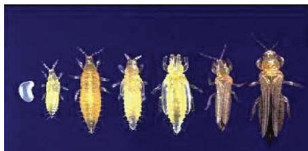
Thrip Egg to Adult Stages of Life

Before the trial, sampling was performed and plots were assigned treatments so that there was no difference between treatments. Insecticide applications were made using a two-gallon hand pump sprayer with a flat jet nozzle. Leaves and flowers were sprayed until runoff was achieved. On weeks where sampling and spray applications were made on the same day, sampling always preceded spray applications. Data was analyzed for significant differences.