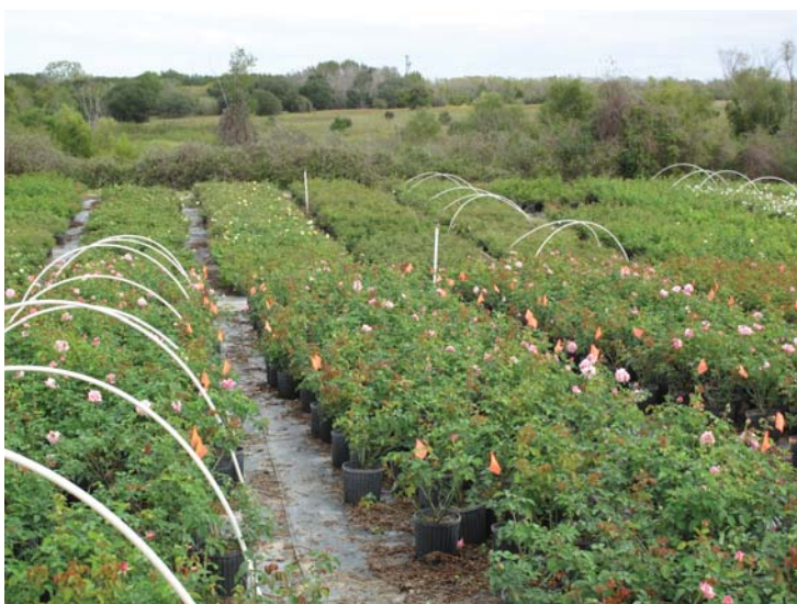
Rows of Roses