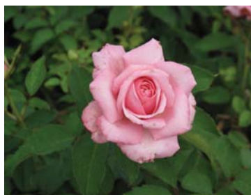
Belinda's Dream Rose