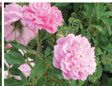
Caldwell Pink Roses