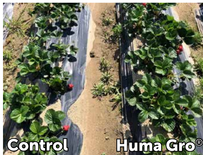
Figure 2. Photo of Control Plants and Huma Gro® Plants in April

The Huma Gro® root dip and UPB fertilizer treatment yielded 30% more marketable strawberries than the grower standard fertilizer program. The 30% yield increase due to BHN fertilizer regime gave a net return of hundreds of dollars per acre, with a ROI ratio of over 3 to 1.